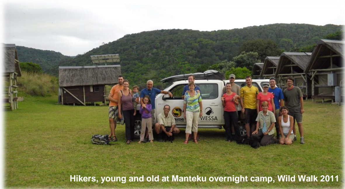
Hikers, young and old at Manteku overnight camp, Wild Walk 2011

Wild Walk 2012 has a number of specific objectives which are presented later in this document. Your participation will contribute to the achievement of these conservation and educational targets.