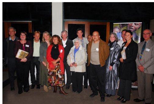
All the WESSA Western Cape Award winners.