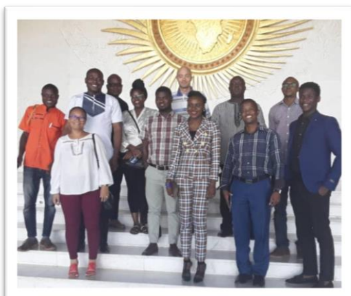
DVMS Innovators in Addis

The working group is reviewing and exploring exchange formats as well as other skills development formats across public and private sectors.