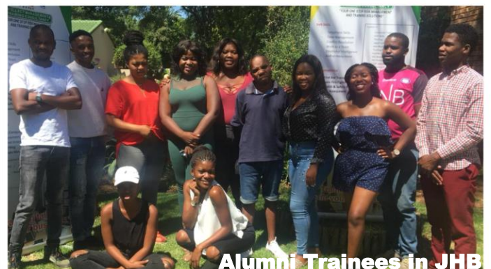
Alumni Trainees in JHB

The trainees have agreed to hold training sessions in their provinces with interested SAAN members so as to ensure they are skills multipliers across the network.